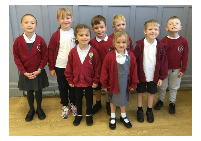
Our Junior School Council